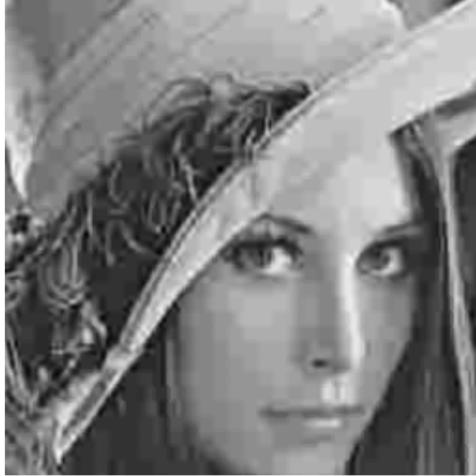
Figure 4: Reconstructed image using the proposed algorithm.