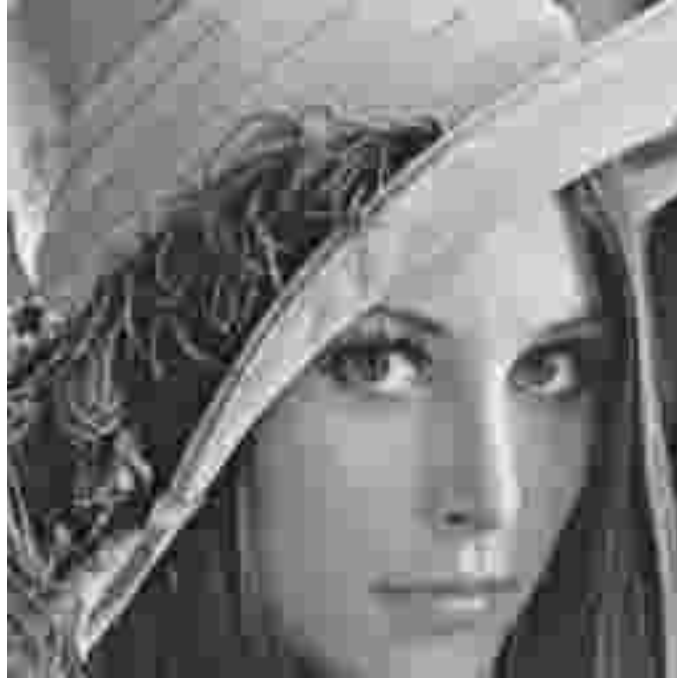
Figure 2: 256 \times 256 center section of blocky “Lena” from JPEG based compression at .24 bpp

We use the peak-signal-to noise-ratio ( PSNR ) as an objective measure of distance between the reconstructed image \hat{\mathbf{f}} and the original image \mathbf{f} . For N \times N images with [0, 255] gray-level range, the PSNR is defined in dB by